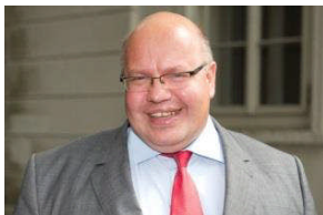
Peter Altmaier (CDU), Chancellery Minister

Assignment: Coordination, crisis management, advisor to the Chancellor