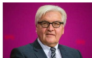
Frank-Walter Steinmeier (SPD), Foreign Minister

Government representative for immigration, asylum seekers and integration