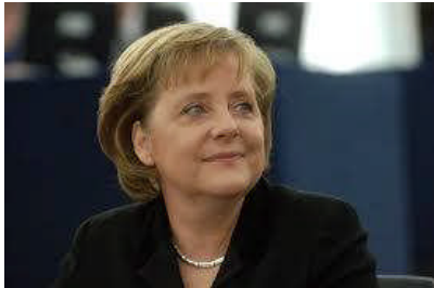
Angela Merkel, Chancellor