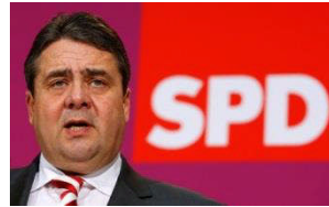
Sigmar Gabriel (SPD), Vice Chancellor Minister for the Economy and Energy