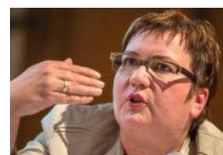
Iris Gleicke (SPD)

Assignment: Coordination, crisis management, advisor to the Chancellor