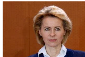
Ursula von der Leyen (CDU), Minister of Defence

Government coordinator for reduction of bureaucracy, better law-making and relationships between Federal States of Germany