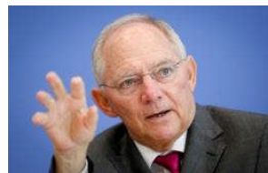
Wolfgang Schaeuble (CDU), Minister of Finance

Government representative for culture and media